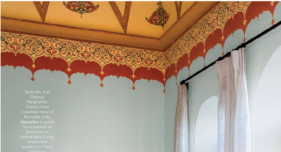
Suite No. 9 at Palazzo Margherita, Francis Ford Coppola's hotel in Bernalda, Italy. Opposite: A peach for breakfast at Sessantio Le Grotta della Civita, a boutique property in Sassi di Matera.