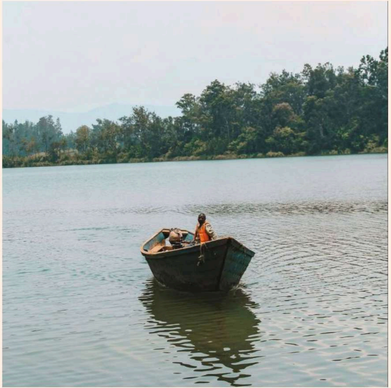
The hotel is intended to support poor Rwandans; guests will be encouraged to make donations rather than pay set rates